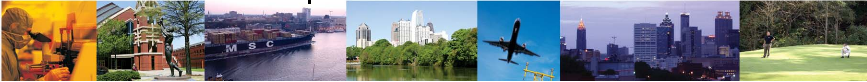
Top 10 Largest U.S. Metro Areas (population greater than 4.5 million)